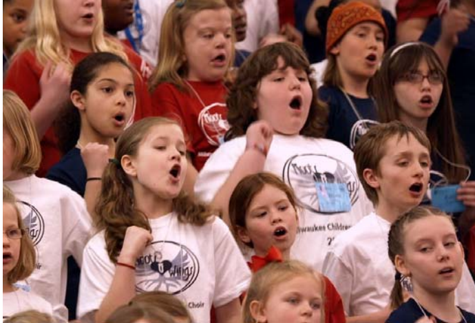
"My dad had tears in his eyes he thought it was so great." Harmony Choir member comment on Roots & Wings — America: All Cultures in Harmony .